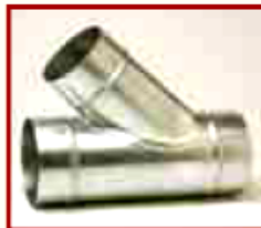
Laterals (Pages 12-14)

Spiral Manufacturing has all the duct components you need to design and build a safe and efficient dust collection system