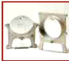
Blast Gates (Pages 31-32)