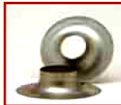
Bellmouth (Page 17)