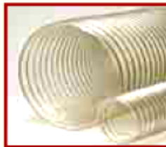
Clear Flex Hose (Page 33)