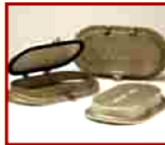
Clean-outs (Page 30)