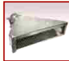
Custom Hoods (Page 19)