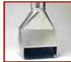
Floor Sweeps (Page 17)