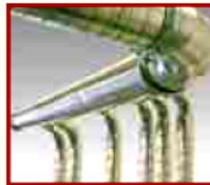
Manifolds (Page 14)