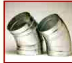
Elbows (Pages 5-6)