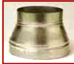
Reducers (Page 15)