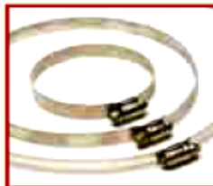
Clamps (Page 34)