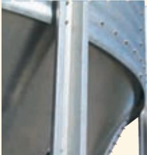
Drip lip: Leads water away from the hopper and lower boot.