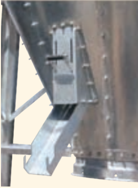
Hopper slide valve is an alternative if you need to discharge feed manually.