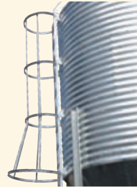
Ladder body-guard until the top for your safety.