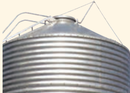
Easy opening system to operate the lid from the ground.