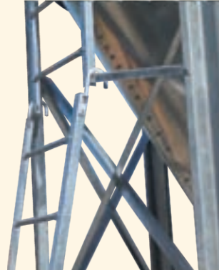
Exclusive detachable ladder system to avoid kids climbing up.